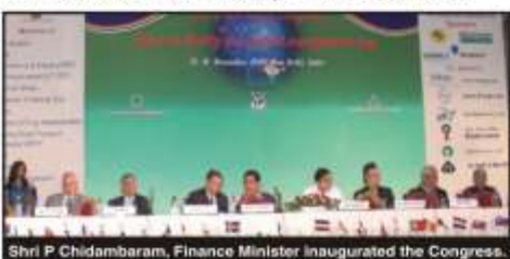
(2005) Finance Minister P Chidambaram with the other dignitaries at the IPMA World Congress.