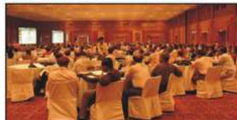
(2007) Over 500 delegates from 20 countries participated in the Global Symposium.